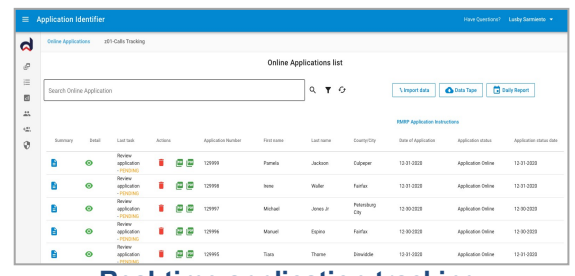
Real-time application tracking

DEVAL's centralized solution is currently used by State Governments and we have processed over 40,000 Rent and Mortgage Relief Program applications.